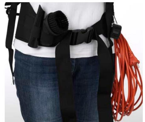
Accessories are stored on the belt for easy access