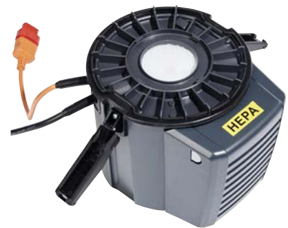
Easy to install HEPA exhaust filter as standard