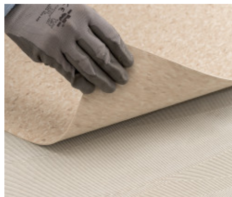
Installation of homogeneous PVC with Ultrabond Eco V4 Evolution