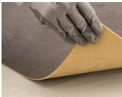
Installation of polyurethane-based flooring with Ultrabond Eco V4 Evolution