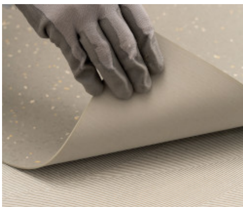
Installation of RUBBER with Ultrabond Eco V4 Evolution