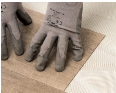
Installation of LVT with Ultrabond Eco V4 Evolution