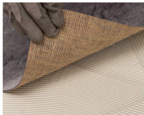
Installation of Linoleum with Ultrabond Eco V4 Evolution