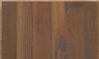
CLAY / PEBBLE