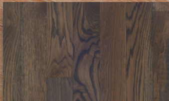
CHARCOAL / AIR