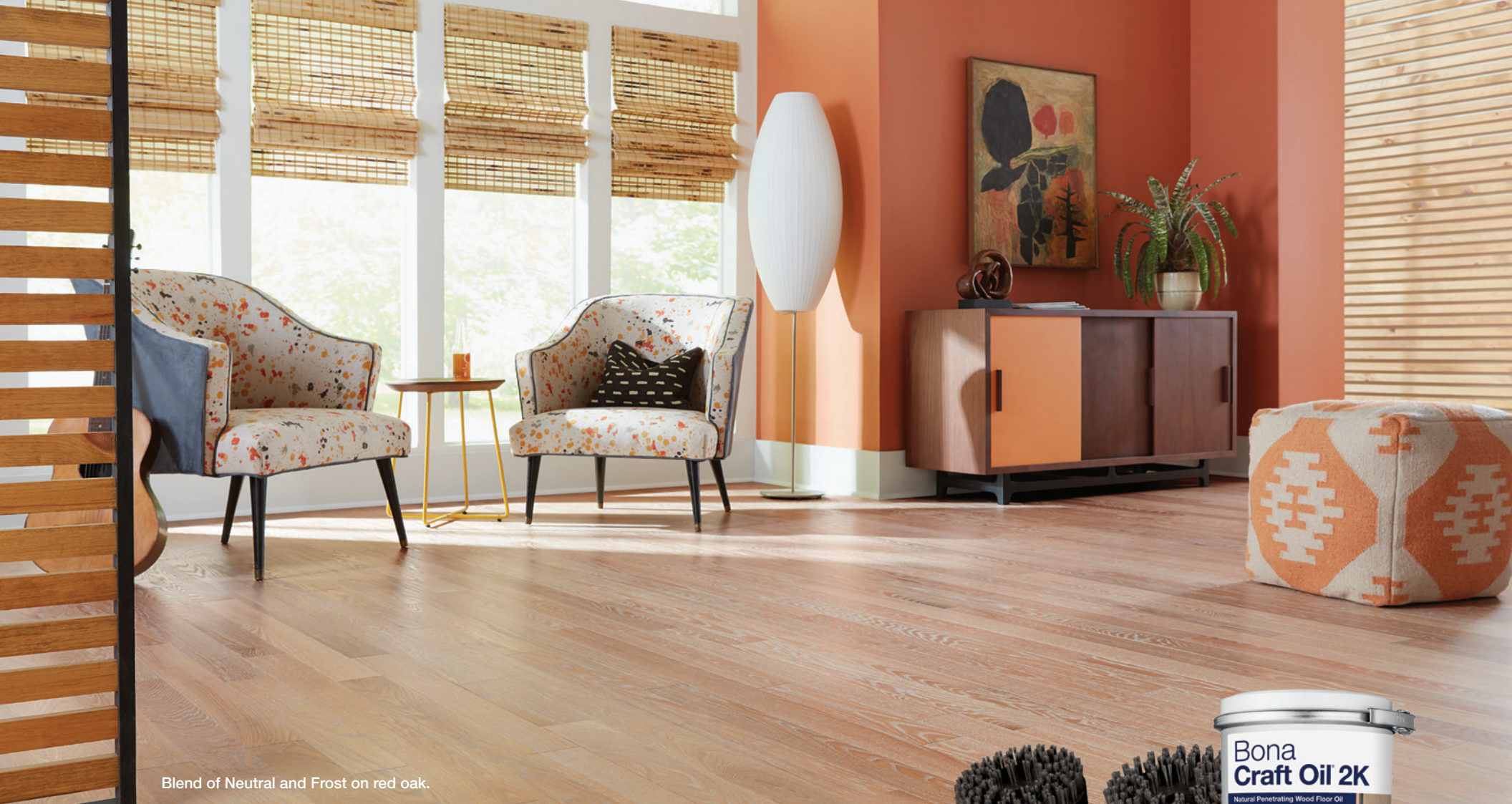
Blend of Neutral and Frost on red oak.