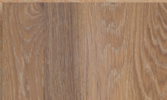
AIR / FROST