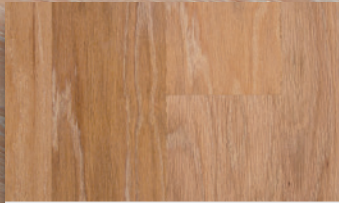
NEUTRAL / FROST