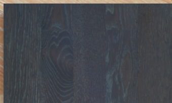
CHARCOAL / SAND