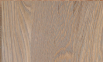
ASH / FROST