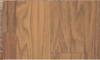
NEUTRAL / ASH