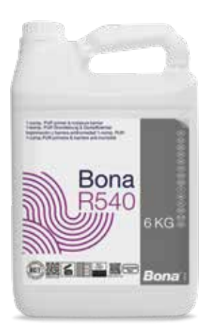
Available in 6kg pack